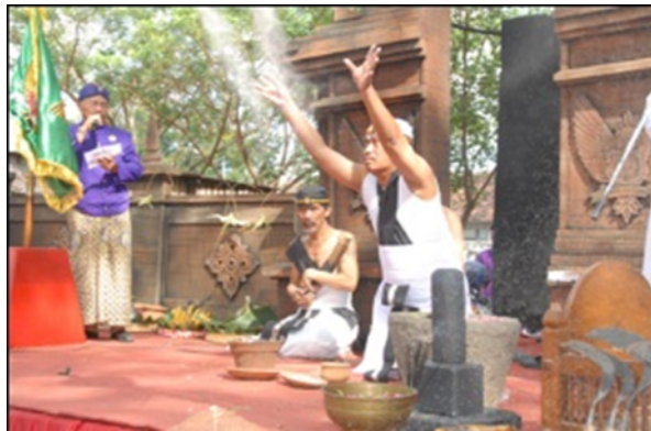
Figure 2 Manusuk Sima Ceremony

The implementation of Manusuk Simas ceremony is always followed by the recitation of incantations or prayers and the burning of incense by the Makudur. Then the ceremonial procession leader continues the ritual by cutting the neck of the black cock or the cemani chicken in walang watu or stone. Next, the Madukur breaks the egg, smashing it to stone or watu sima , and sprinkles ashes. This procession is a process that must be done by the Makudur because it contains a symbolic meaning that is intended to all visible and supernatural creatures so as not to dare to violate the provisions of the sima region. Otherwise, they will get wretched or a terrible catastrophe that can be symbolized like a chicken head separated from its body, and crushed eggs smashed by sima stone. Their life will float like the ashes carried by the wind.