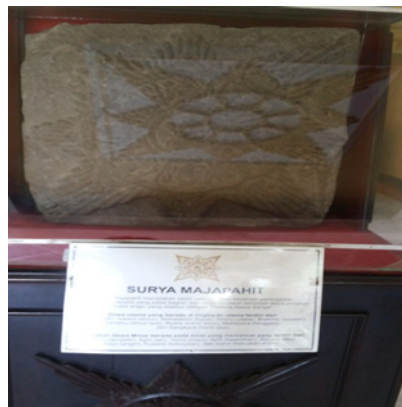
Figure 3 The Emblem of the Sun Majapahit ( Nawa Sanga )

In the context of the Majapahit Empire during the time of Hayam Wuruk, it is clear that the implementation of Nawa Sanga was an obligation for all levels of society residing in its territory which includes the sima . This spiritual energy is a form of internal government control system applied. It is not surprising that Majapahit succeeded in becoming a kingdom that united the regions of the archipelago.