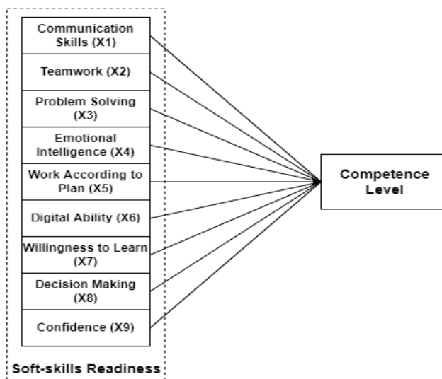
Figure 2. Research Paradigm

To find out the dominant factor in soft skills readiness that is more influential on vocational education graduates' competence level, a multiple regression analysis with the research paradigm presented in figure 2 is performed.